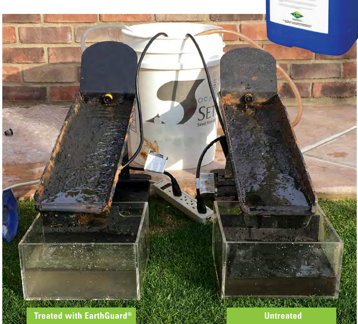
Temporary Erosion Control EarthGuard® Soil Stabilizer

EarthGuard® has the unique ability to flocculate and limit the migration of ash, sediment and toxic constituents that can be carried away by stormwater and wind.